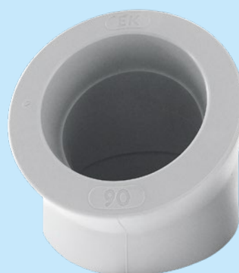
Elbow 45°, 90 mm, PPR

Higher resistance of the PP-RCT material allows reduction in wall thickness