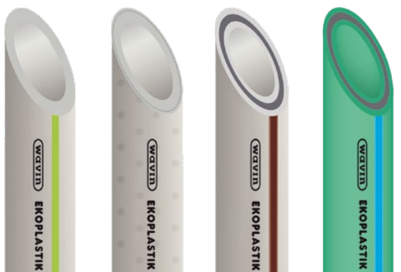
Ekoplastik EVO PP-RCT Ø 16 –125 mm Ekoplastik Stabi Plus Ø 16 –110 mm Ekoplastik Fiber Basalt Plus Ø 20 –125 mm Ekoplastik Fiber Basalt Clima Ø 20 –125 mm